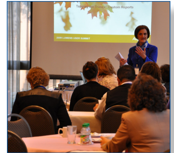
Augusoft Lumens User Summit presentation

For one year following your go-live date, you and your Augusoft IM will schedule regular checkpoints for questions, as well as feature-specific updates and training.