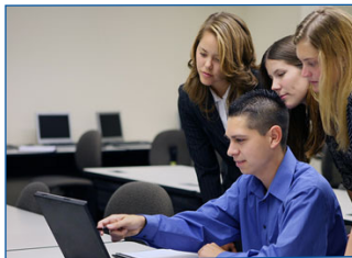
Onsite training provided with Lumens Premier Implementation

One Year Program Consultation: After one year of using Lumens, your Premier Implementation Team will perform an onsite software and program review to offer recommendations on additional ways to benefit from Lumens, as well as provide you with other non-software related suggestions for improving your program's performance.